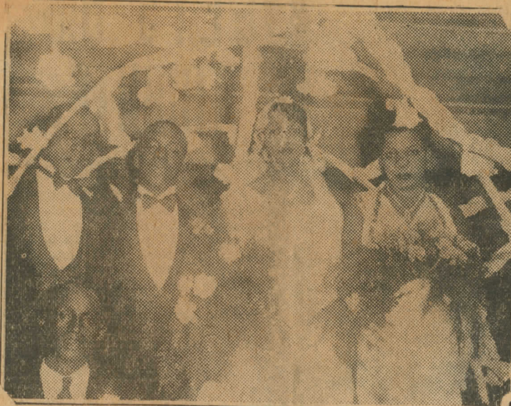
The above photo was snapped at the St. Claude Inn and shows the main participants in the wedding. Several thousands were on hand to witness the gala occasion and to wish the newlyweds happiness.